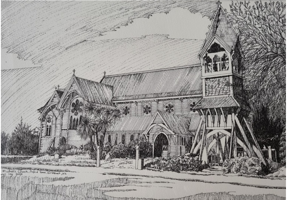
Artist: Sharyn Ley—2005

The Twenty-fifth Sunday of Ordinary Time 22 September 2024